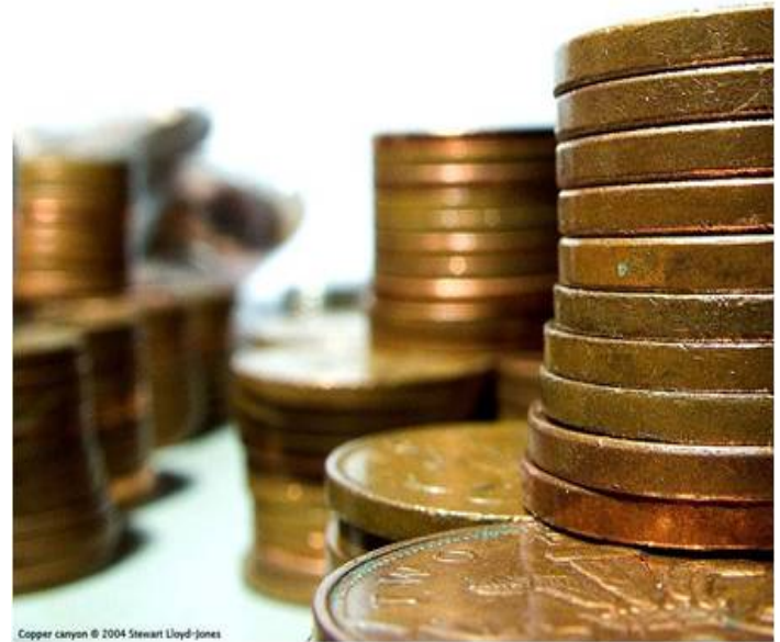
Copper canyon